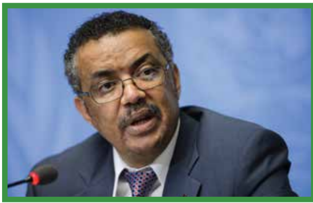
Dr. Tedros Adhanom Ghebreyesus the Director General, WHO delivering a video Message