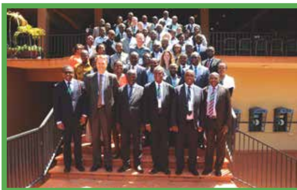
Delegates at the Special Consultation on Governance in Kampala